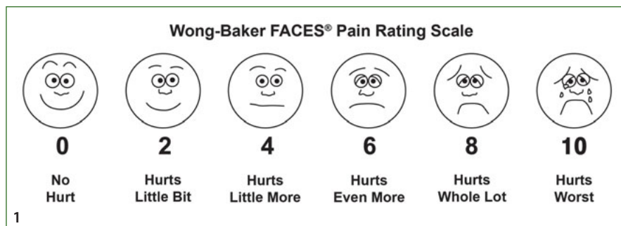
Fig 1 Wong-Baker faces pain rating scale. 16,17 ©1983 Wong-Baker FACES Foundation. Used with permission from www.WongBakerFACES.org. Originally published in Whaley and Wong, 31 © Elsevier.

Patients whose treatment was not completed due to lack of cooperation were scheduled to another dental appointment to provide treatment under sedation out of the study scope.